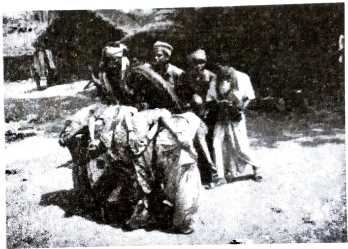
Juang dance in kansa village